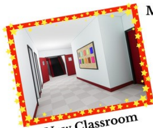
New Classroom Design

Our LAST 24 hours with Money Matching Opportunities