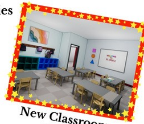
New Classroom Design

Follow our school on Instagram: spx_rebels